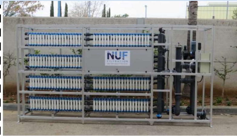
Industrial NUFilter plants – modular, fully automated units for public swimming pools